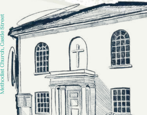
Methodist Church, Castle Street