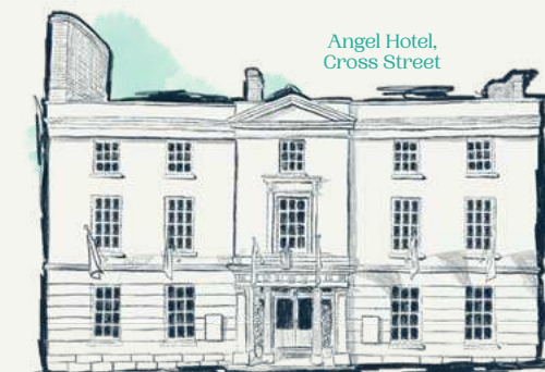
Angel Hotel, Cross Street